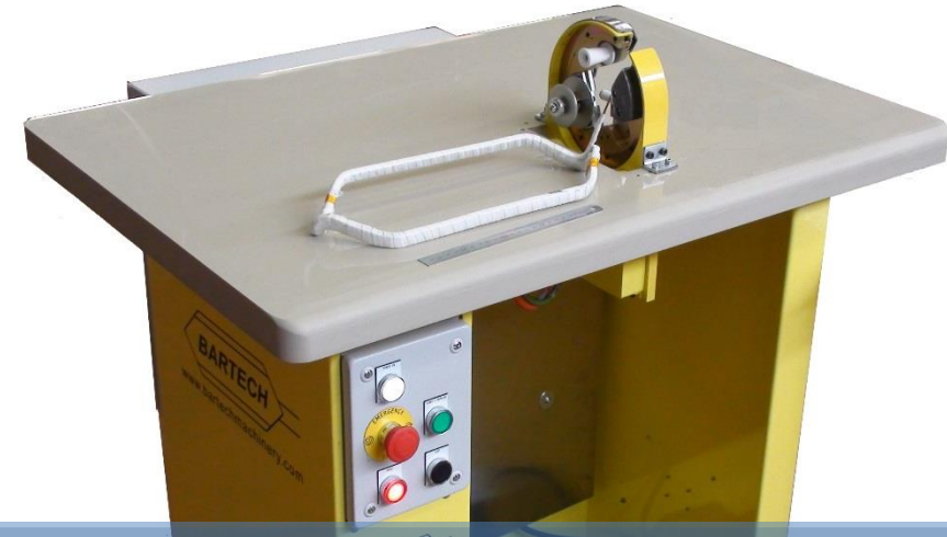
Table Insulating Machine (TIM)

VINCENT INDUSTRIE's (VI), worldwide known equipments perfectly combine performance, quality and price